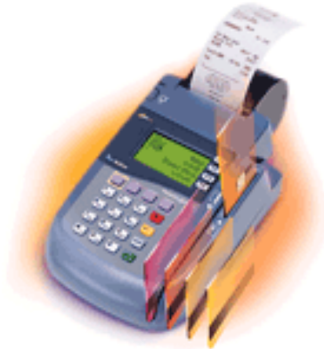
BankWORKS® POS Network Controlling - Non-stop real-time communication

The BankWORKS® POS Network Controller is an acquiring financial institution's front line and is one of the most critical parts of the card business. Your image with merchants and cardholders will depend greatly on the reliability, efficiency, security and mobility of your POS management system. The POS Controller Module takes full advantage of the newest communication and encryption techniques.