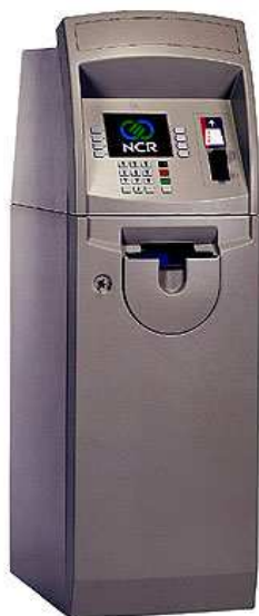
BankWORKS ® ATM Network Controller - Non-stop real-time communication

The BankWORKS ® ATM Network Controller is the most sophisticated asset at an acquiring financial institution's front line. The reliability, efficiency and security of your ATM management product contributes greatly to the Bank's image with cardholders and Card Organisations. The module takes advantage of the newest communication and encryption techniques.